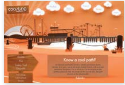
A SKETCH (left, seat plus helmet storage) and a PROTOTYPE (middle) show elements of Coasting bicycles. Shimano's Coasting WEBSITE (right) points users to safe bike paths.

an activity that was simple, straightforward, and fun. Coasting bikes, built more for pleasure than for sport, would have no controls on the handlebars, no cables snaking along the frame. As on the earliest bikes many of us rode, the brakes would be applied by backpedaling. With the help of an onboard computer, a minimalist three gears would shift automatically as the bicycle gained speed or slowed. The bikes would feature comfortably padded seats, be easy to operate, and require relatively little maintenance.